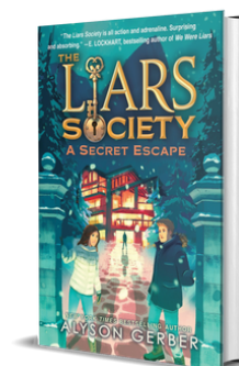
The Liars Society #3 HC: 9781546198574 EBK: 9781546198581 On Sale April 7, 2026