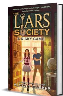
The Liars Society #2 HC: 9781338859249 EBK: 9781338859263