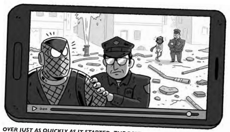
OVER JUST AS QUICKLY AS IT STARTED, THE BATTLE LEFT NEWARK AVENUE A LITTLE WORSE FOR WEAR. BUT THANKFULLY, OUR NEW HERO GOT THE SHOCKER BACK WHERE HE BELONGS! BEHIND BARS!