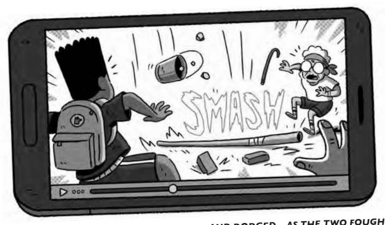
THE CITIZENS OF NEW JERSEY WATCHED—AND DODGED—AS THE TWO FOUGHT!