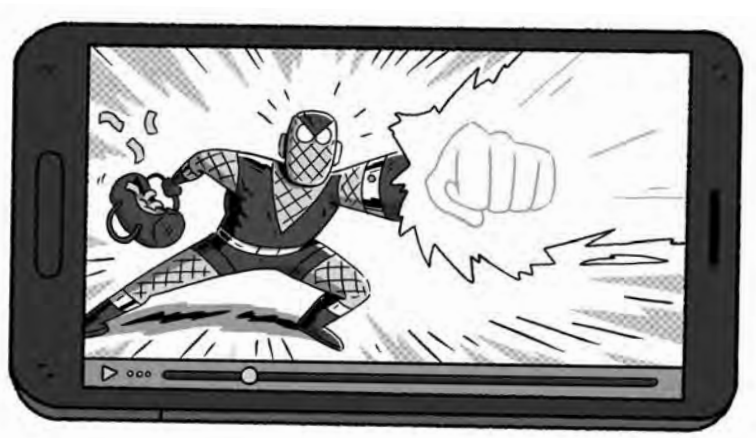
BY THE SHOCKER!