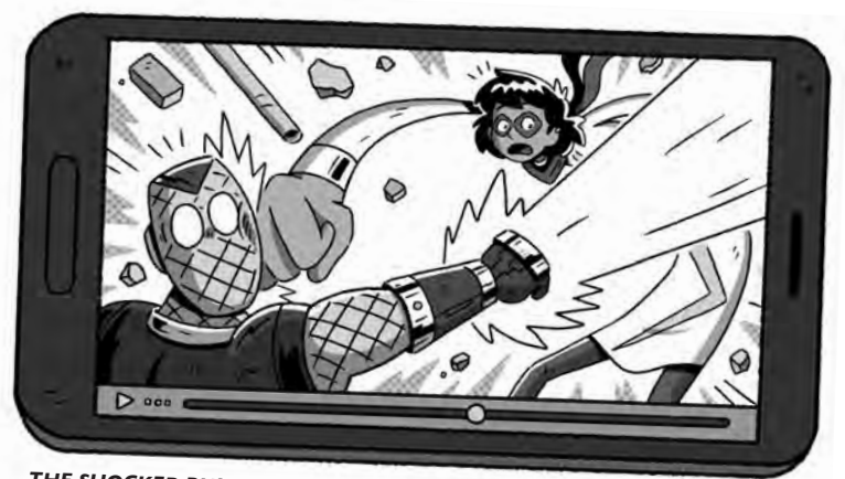
THE SHOCKER PULLED NO PUNCHES, AND JERSEY CITY WAS FEELING IT!