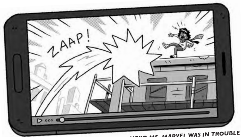
JERSEY CITY'S MYSTERIOUS NEW SUPER HERO MS. MARVEL WAS IN TROUBLE EARLIER THIS EVENING. AFTER FACING OFF WITH AND DEFEATING THE TINKERER, MS. MARVEL WAS SHOCKED...