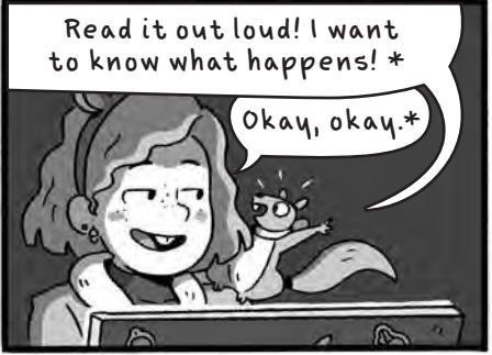
*Translated from squirrel-ese